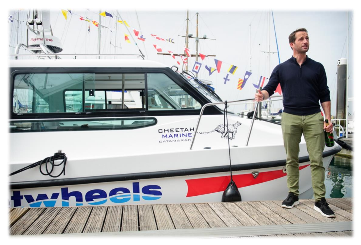
Sir Ben Ainslie launches a new Wetwheels Solent after a successful fundraising campaign

• The following table explains how income targets meet our annual running costs and the purchase of 4 boats over the next 5 years: